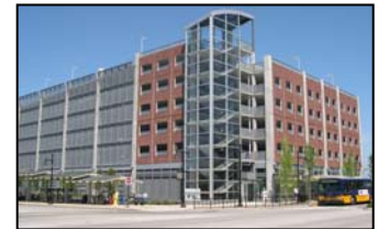
Renton Parking Garage Renton, Washington