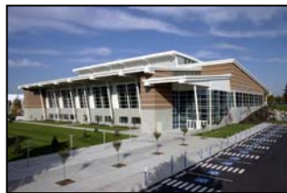
Gonzaga Arena Spokane, Washington