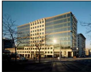
5 th & Jackson Building Seattle, Washington