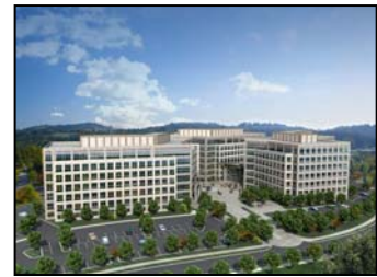
Advanta Office Commons Bellevue, Washington