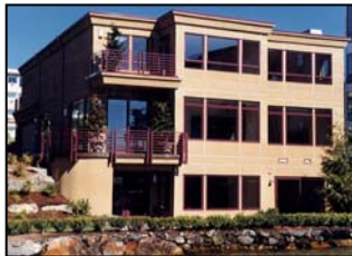
Klein Residence Kirkland, Washington