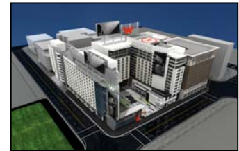
Hollywood & Vine, W Hotel & Residences Hollywood, California