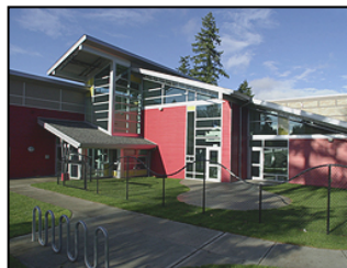
Jackson Park Youth Center Bremerton, Washington