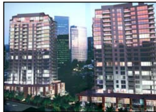
Washington Square Bellevue, Washington