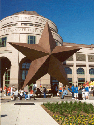
Texas State History Museum