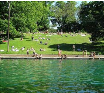
Barton Springs Pool